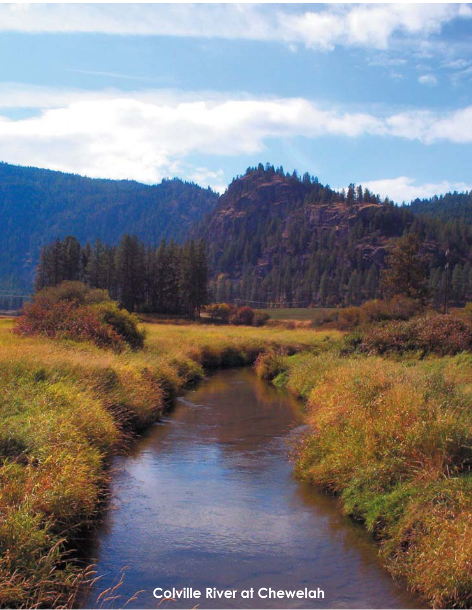
Colville River at Chewelah